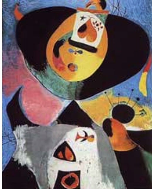
1190 MIRO, JOAN Portrait No. 1