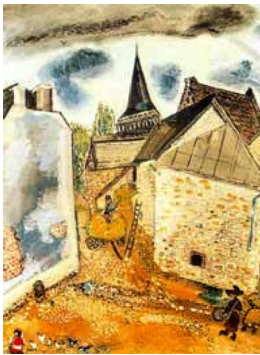
1205 CHAGALL, MARC Chambon-sur-Lac