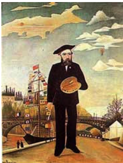
1310 ROUSSEAU, HENRI Self-Portrait