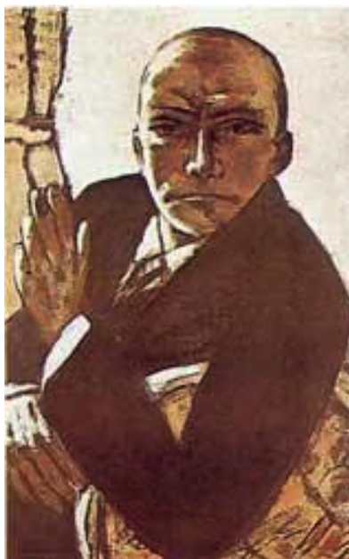
525 BECKMANN, MAX Self-Portrait