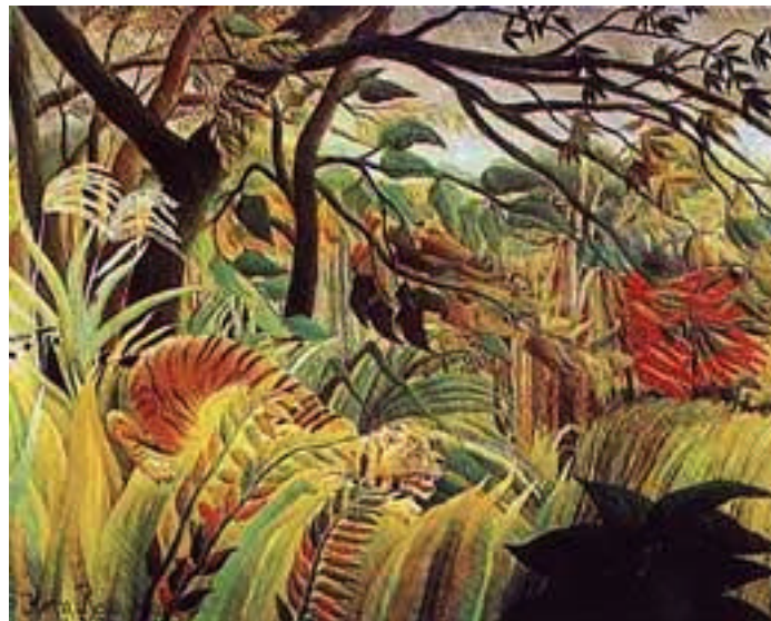
1428 ROUSSEAU, HENRI Surprised! Storm in the Forest

National Gallery of Art Washington, D.C.