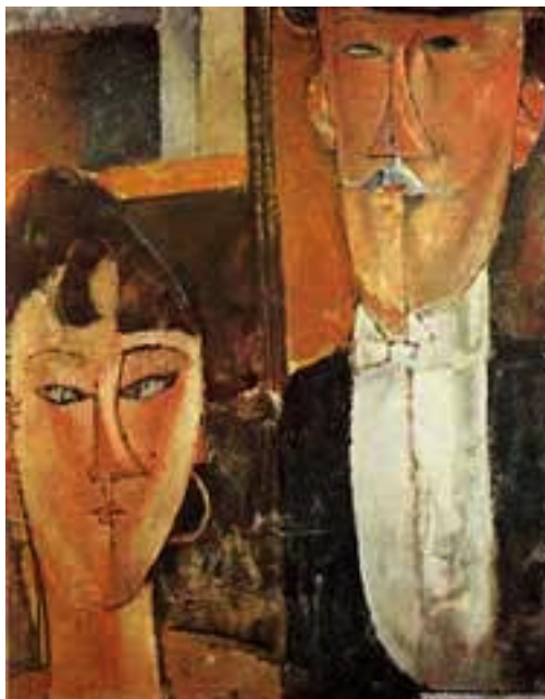
1181 MODIGLIANI, AMEDEO Bride and Groom