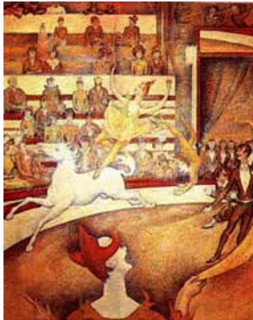
1155 SEURAT, GEORGES Circus