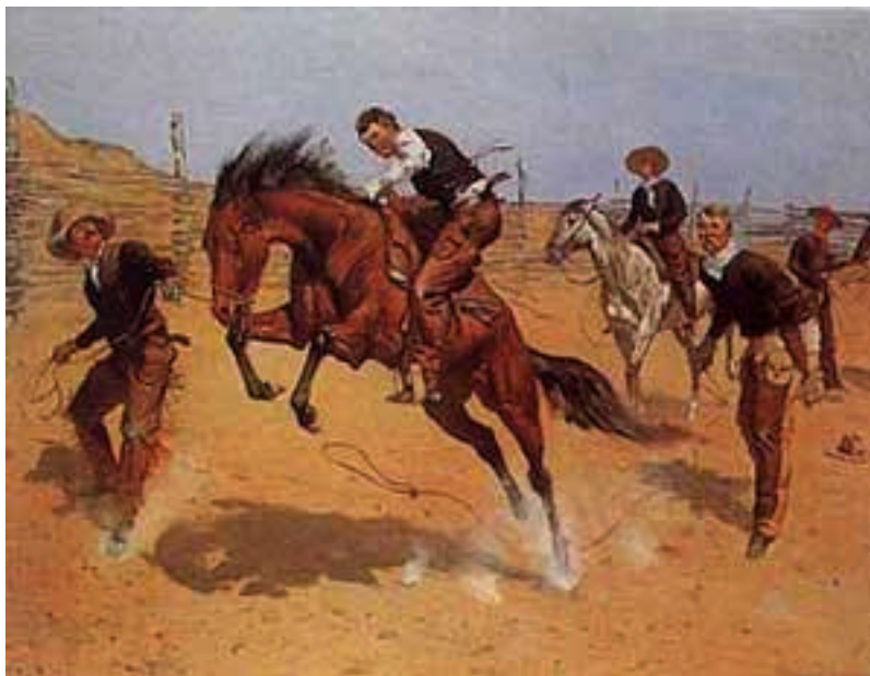
992 REMINGTON, FREDERIC "Turn Him Loose, Bill"