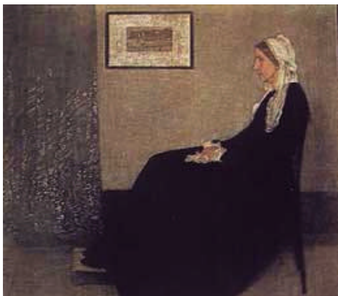
860 WHISTLER, JAMES MCNEILL Study in Grey and White, "The Artist's Mother"