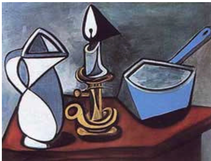
1022 PICASSO, PABLO Enamel Saucepan