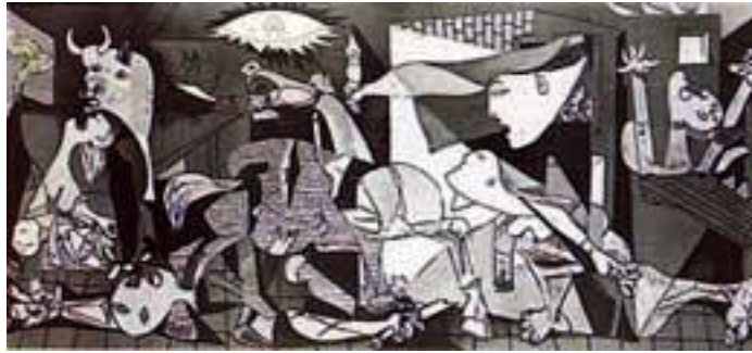
1295 PICASSO, PABLO Guernica