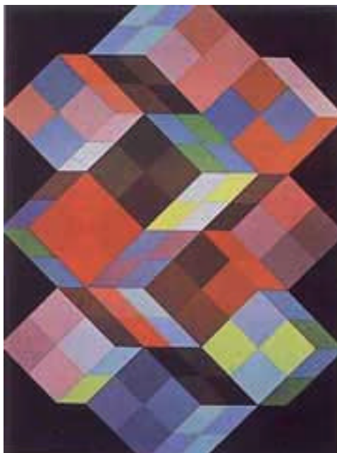
1420 VASARELY, VICTOR Tridem K