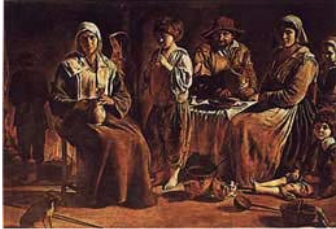
1314 LE NAIN, ANTOINE AND LOUIS Family Of Peasants