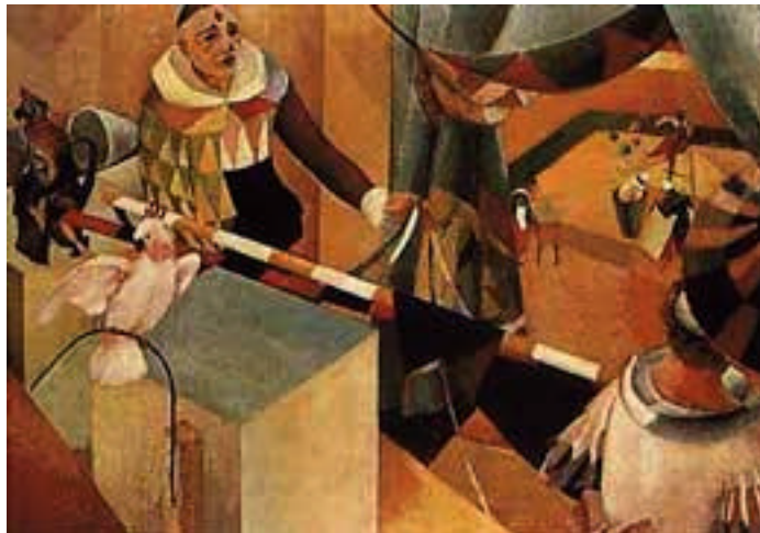
1361 MOILLIET, LOUIS In the Circus