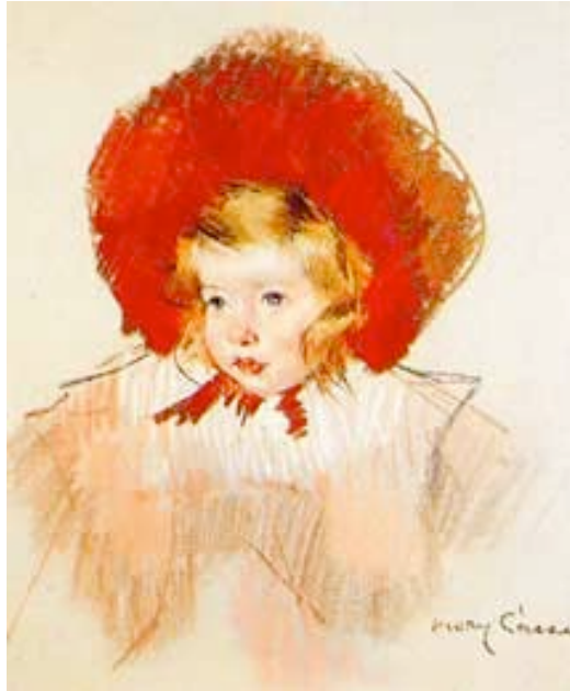
1040 CASSATT, MARY Child With Red Hat Clark Institute Williamstown, Massachusetts