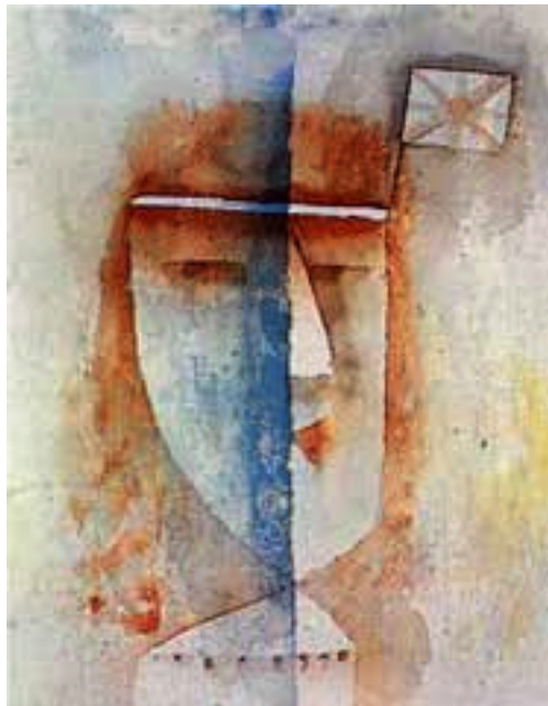
1087 KLEE, PAUL Girl with Flag