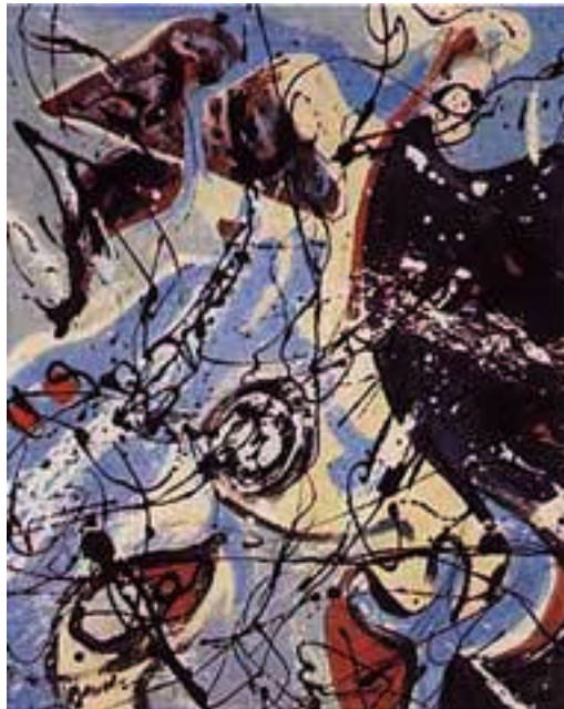
840 POLLACK, JACKSON Composition