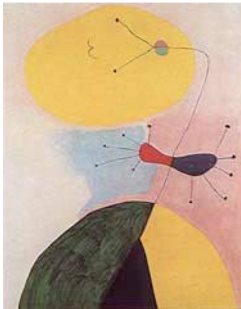
1341 MIRO, JOAN Portrait 1938 Kunsthhaus Zurich