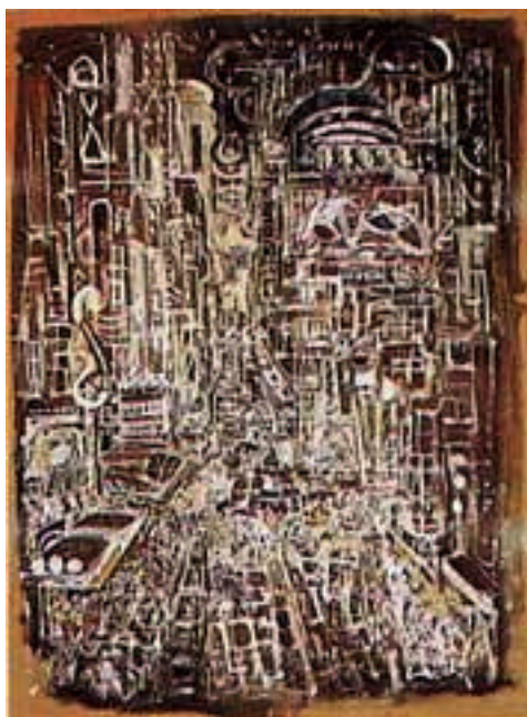
1405 TOBEY, MARK Broadway 1936