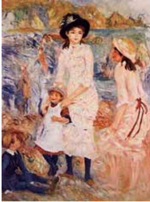
1206 RENOIR, PIERRE AUGUSTE Children on the Seashore

Museum of Fine Arts Boston, Massachusetts