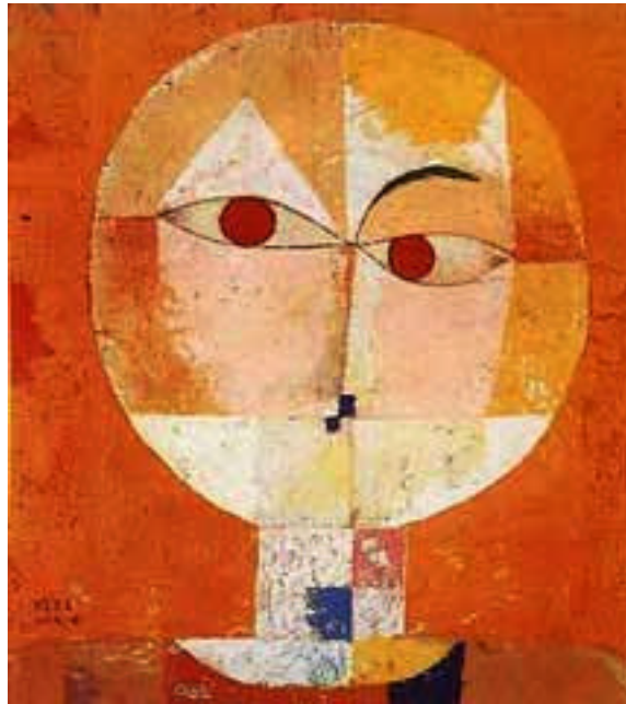
1233 KLEE, PAUL Head of a Man