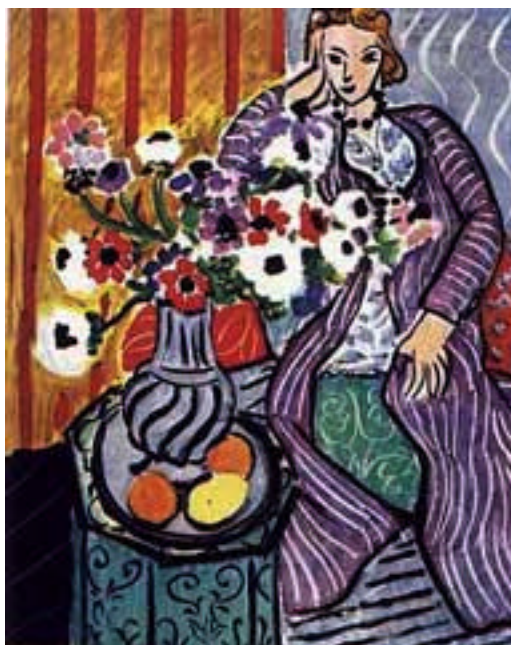
1126 MATISSE, HENRI The Purple Robe