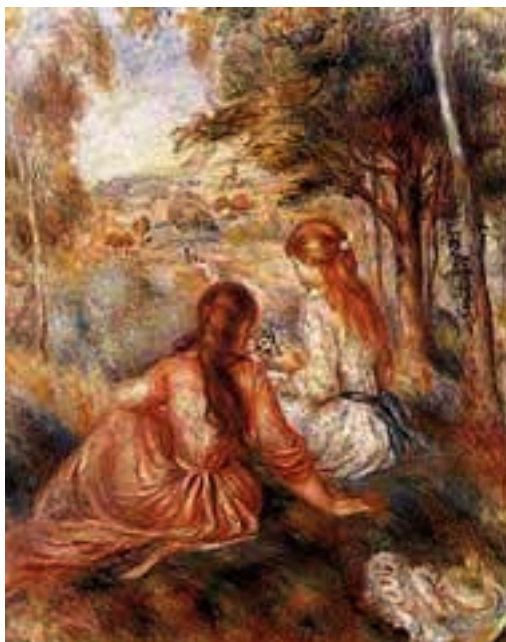
1113 RENOIR, PIERRE AUGUSTE In the Meadow