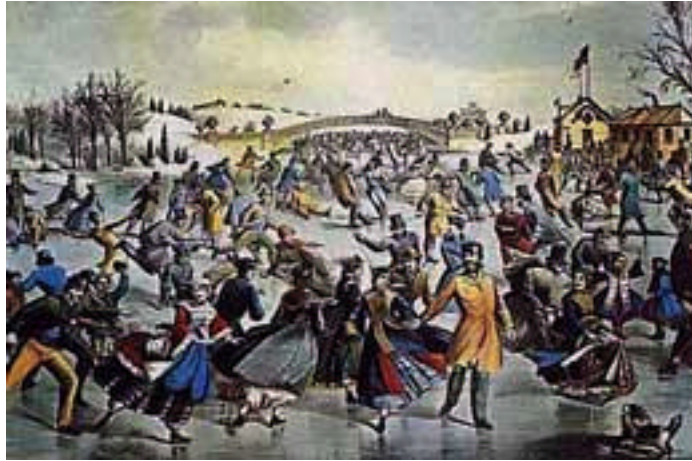
889 CURRIER & IVES Central Park: Winter