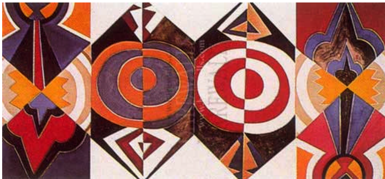
972 OVERSTREET, PHILLIP Justice and Peace