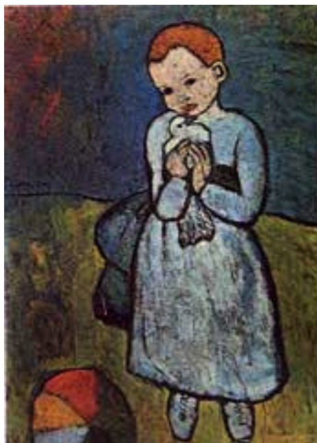
1093 PICASSO, PABLO Child with a Dove