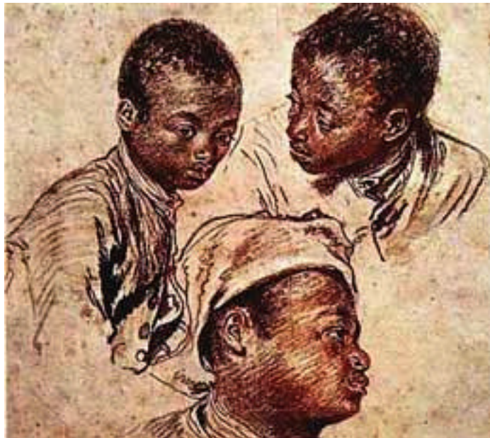
207DR WATTEAU, JEAN ANTOINE Three Negro Boys