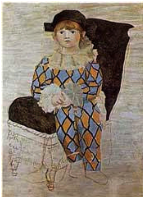
1230 PICASSO, PABLO The Artist's Son