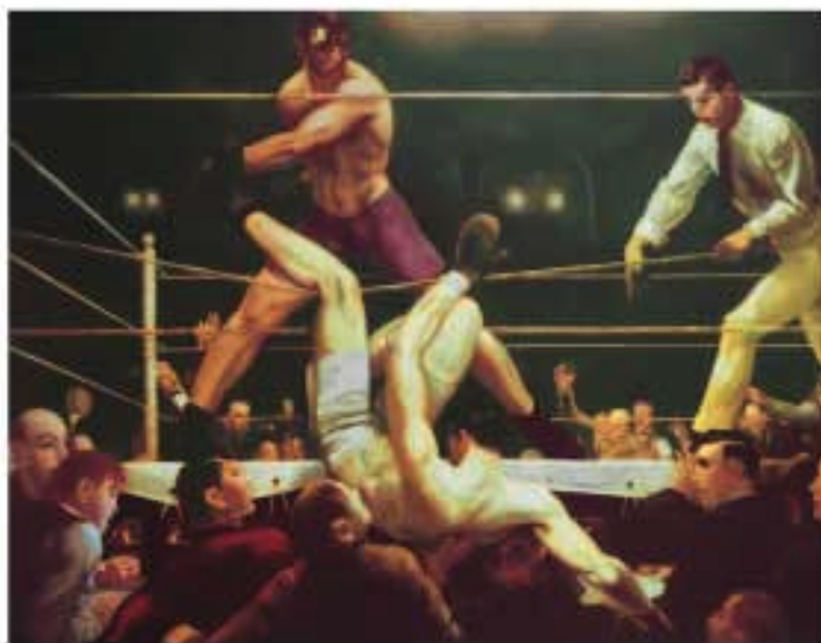
825 BELLOWS, GEORGE Dempsey and Firpo

Chrysler Garbisch Collection National Gallery of Art Washington, D.C.