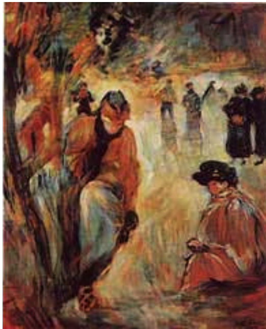
1246 MORISOT, BERTHE Skating in the Park ( SKATING IN THE BOIS DE BOULOGNE )