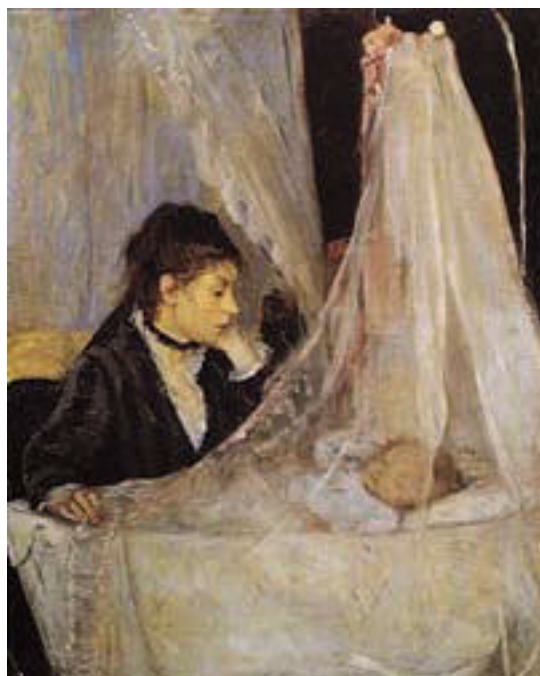
1223 MORISOT, BERTHE The Cradle