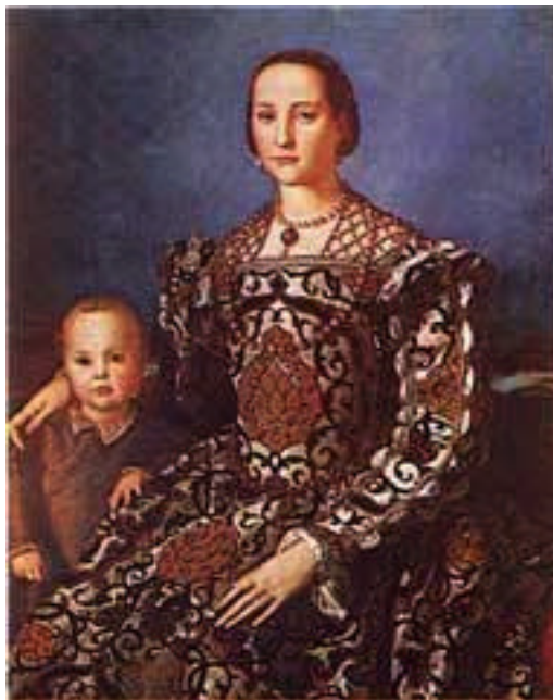
112 BRONZINO Eleanore and Son