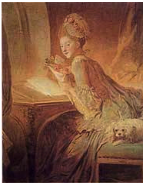
1322 FRAGONARD, JEAN HONORE Le Billet Doux Metropolitan Museum of Art New York