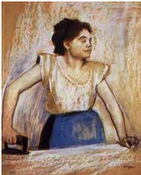
1041 DEGAS, EDGAR Girl at Ironing Board