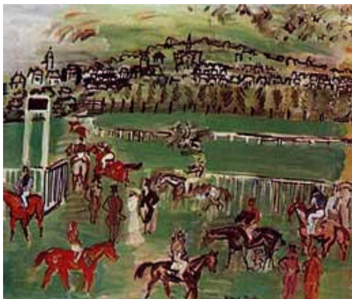
1258 DUFY, RAOUL The Race Track