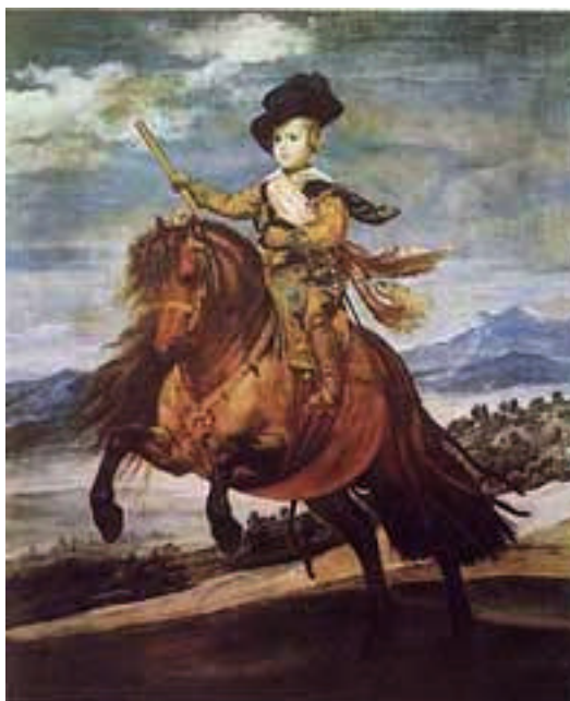
305 VELAZQUEZ, DIEGO Prince Balthazar-Carlos on a Pony