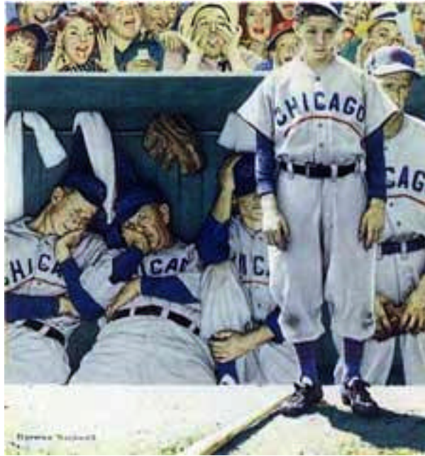
(1813) ROCKWELL, NORMAN The Dugout