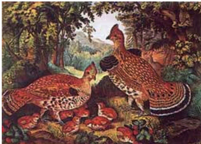
891 CURRIER & IVES Happy Family