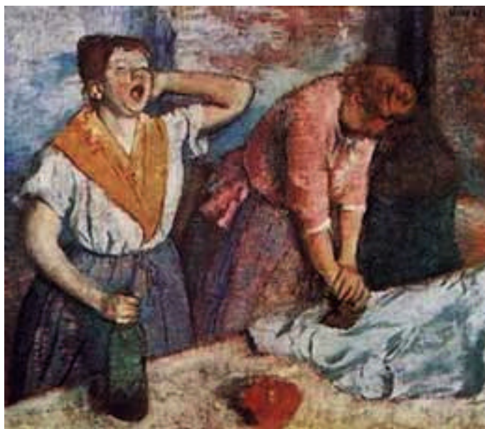
1133 DEGAS EDGAR The Ironers