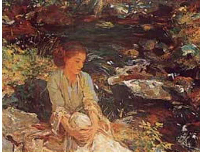
880 SARGENT, JOHN SINGER Black Brook