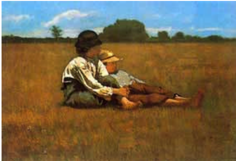
803 HOMER, WINSLOW Boys in a Pasture

Museum of Fine Arts Boston, Massachusetts