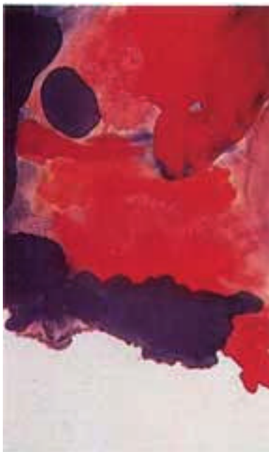
1410 FRANKENTHALER, HELEN Blue Atmosphere