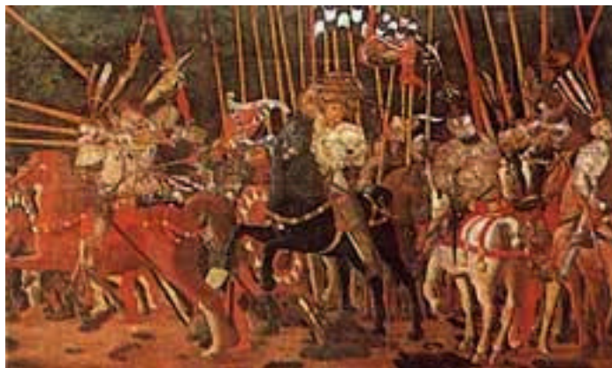
120 UCCELLO, PAOLO Battle of San Romano