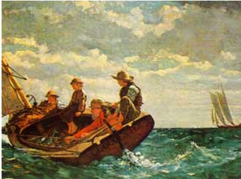
809 HOMER, WINSLOW Breezing Up

National Gallery of Art Washington, D.C.