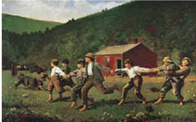
867 HOMER, WINSLOW Snap the Whip