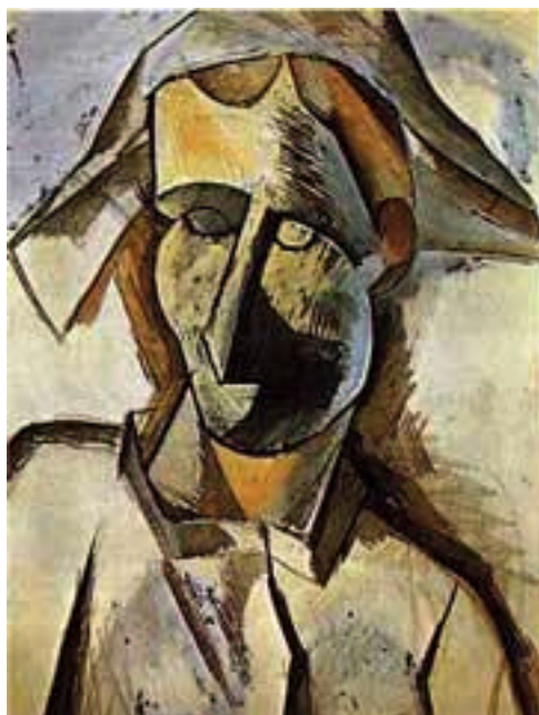
1309 PICASSO, PABLO Head of a Harlequin