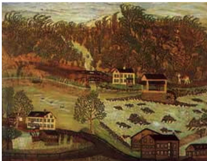
832 PICKETT, JOSEPH Coryell's Ferry, 1776